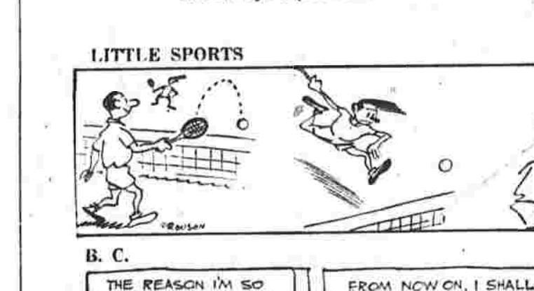
LITTLE SPORTS BY ROUSON