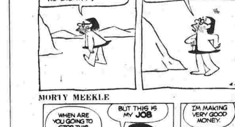
B. C. BY JOHNNY HART