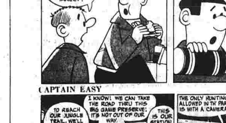
THIRTY MEEKLE BY DICK CAVALLI