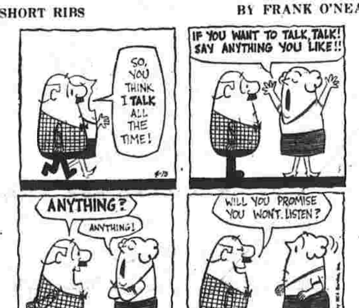
SHORT RIBS BY FRANK O'NEAL